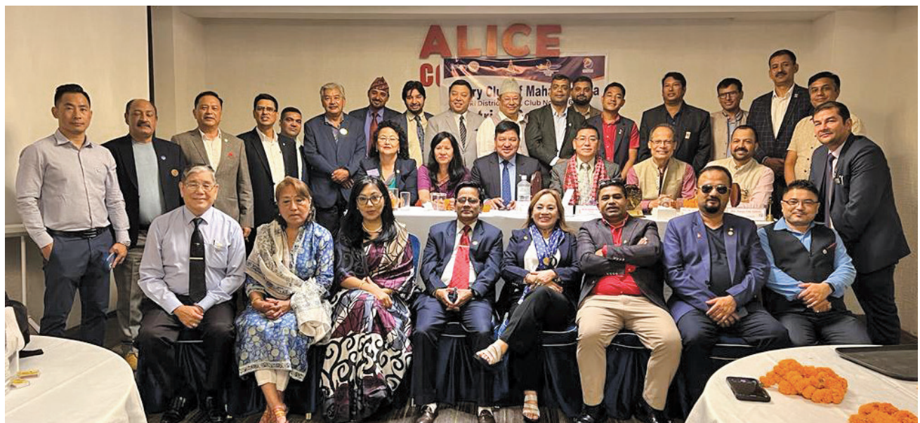
RC Mahabouddha DG Visit (17th August 2023)