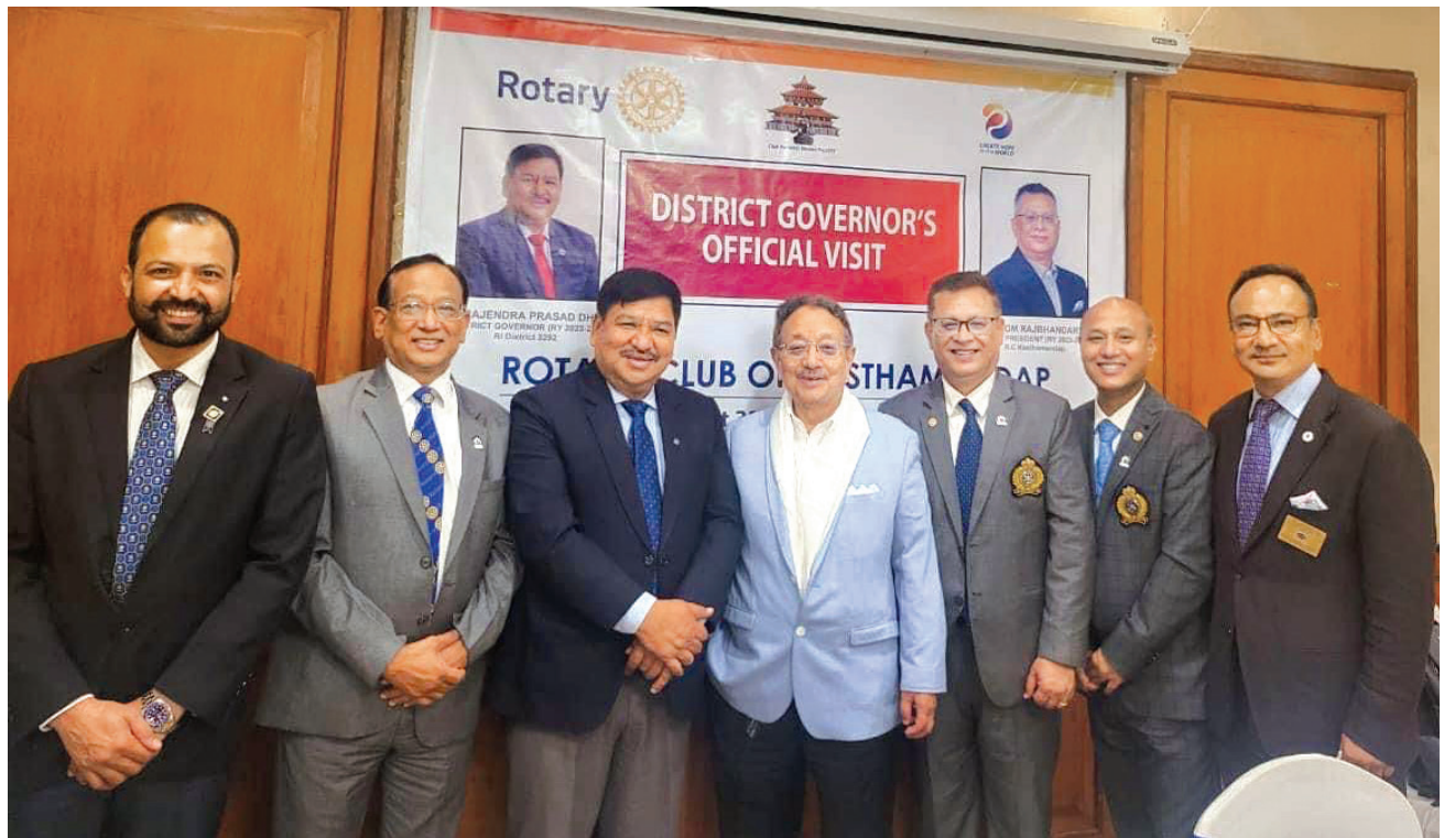
Rotary Club of Kasthamandap Kathmandu DG Visit on 4th August 2023