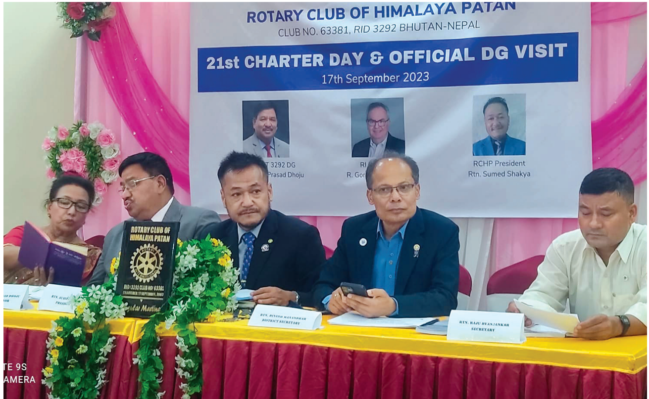
Rotary Club of Himalaya Patan DG Visit on 17th September 2023