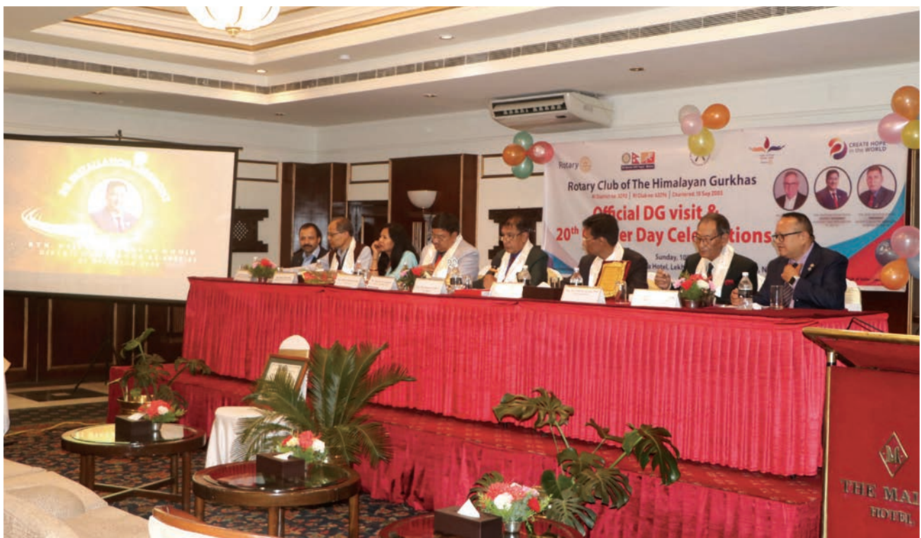
The Himalayan Gurkhas DG Official Visit - Chartered Day Celebration