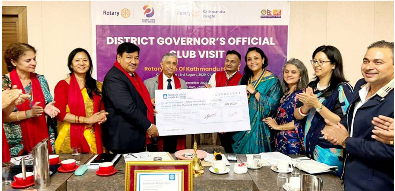
RC Kathmandu Height DGs Visit on 9th September 2023