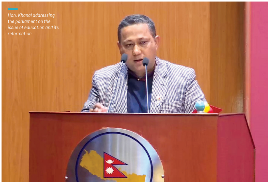
Hon. Khana addressing the parliament on the issue of education and its reformation