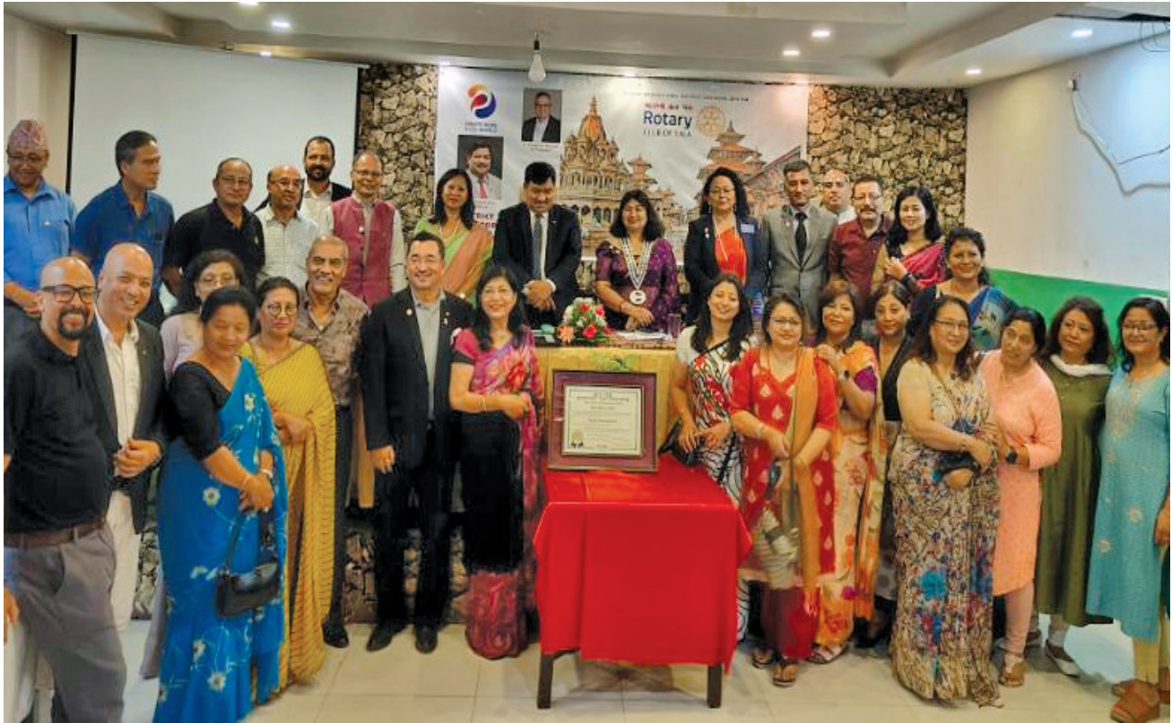
Rotary Club of Yala DG Official Visit on 2nd September