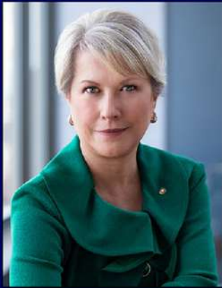
Jennifer Jones RI President

Rotary recently surveyed our members and found something that should be unsurprising but still caused many of us in Rotary leadership to sit up and pay attention: The single most important factor in member satisfaction is the club experience. How at home you feel in your club, how rewarding club meetings are, and how engaged you feel in service projects.