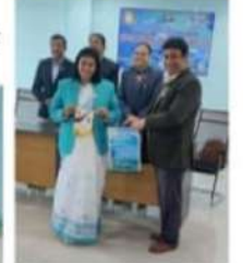
तस्वीर: कण्डा साटासाट पछि रोटरी क्लब अफ हेटौडाका पदाधिकारीसंग तस्वीर लिई अर्चनार्थक