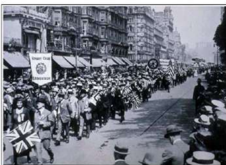
Expanding Our Reach 1912-1930