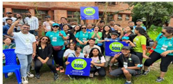
Rotary Club of Gyaneswor, along with RC Rajdhani, Innerwheel Club of Rajdhani, Rac Rajdhani, RAC Gyaneswor Cist and Pedal organized a Tree Plantation program at Ashadeep Nepal,