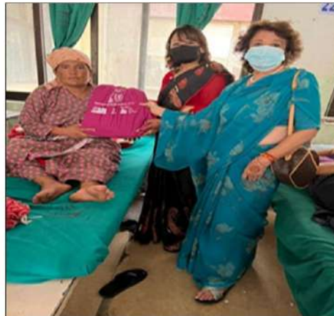
Food and clothes distribution to mothers and newly born babies at Prasuti Griha.Thapathali