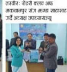
तस्वीर: रोटरी क्लब अफ चिन्तापुर संज कण्डा साटासाट गर्दै अर्चनार्थक उपहारहरू