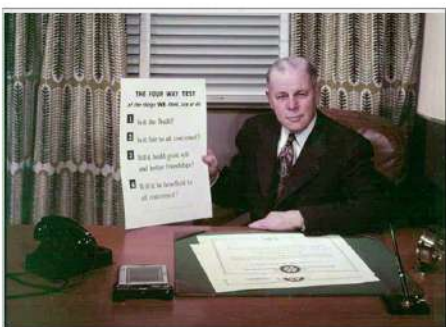
Cultivating Leaders 1931-1957

On Monday, January 16, 2023, the Rotary Club of Chitwan and the Chamber of Commerce and Industry Chitwan collaborated to hold a blood donation camp at Chitwan Mahotsab Parisar, where a total of 60 pints of blood were collected.