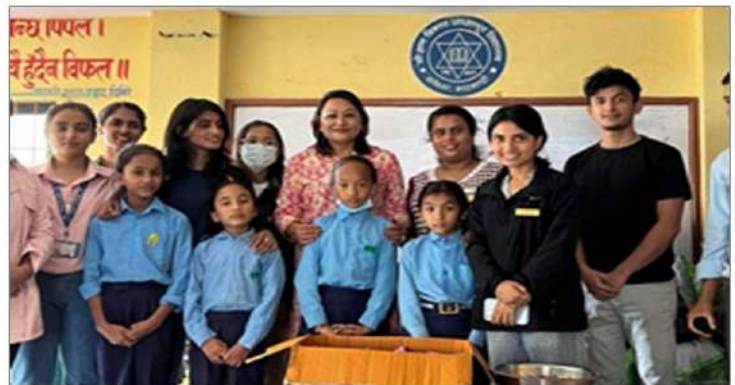
58th National Children's Day ,14th September 2022 at Gyan Bikash Aadharbhut School,Gyaneswor