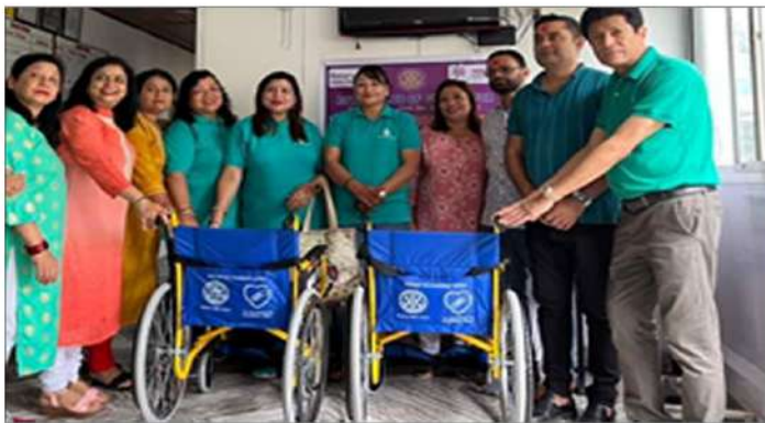
Wheelchair Handover at Spark Health