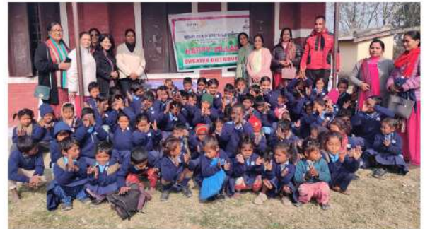
school's principal in to promote moral values in both teachers and students.

The Rotary 4-Way Test hoarding board was also given to the