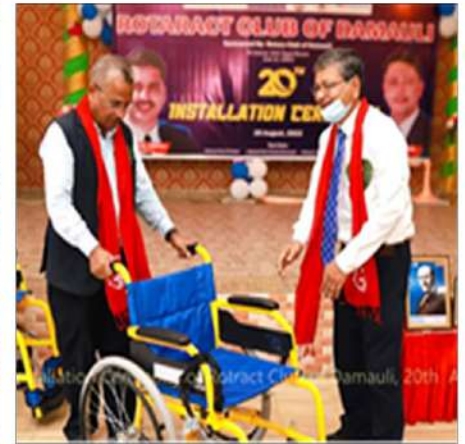
Wheelchair Handover at Deurupa Sapkota, Vyas 10, Deurali & Jhalak BK Vyas-8 Tanahun