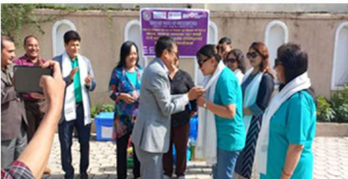
Relief Handover Jointly with RC Durbarmarg, RC Dhulikhel & RC Baglung for Singti Bazar and Chilanga of Bigu Rural Municipality of Dolakha