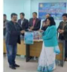
तस्वीर: रोटरी क्लब अफ चिन्तापुर संज कण्डा साटासाट गर्दै अर्चनार्थक उपहारहरू