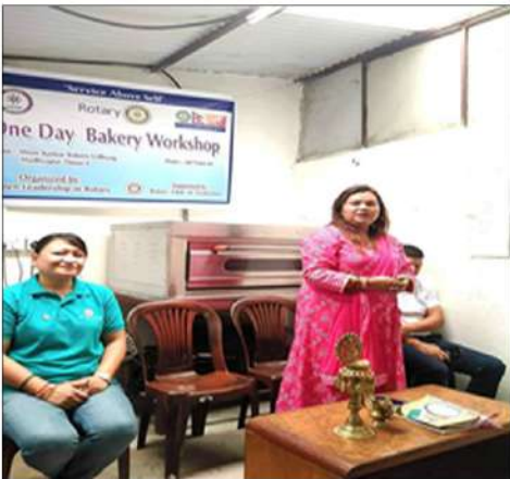
Bakery Training at Shree Kumar Bakery Udhyog; Sanothimi