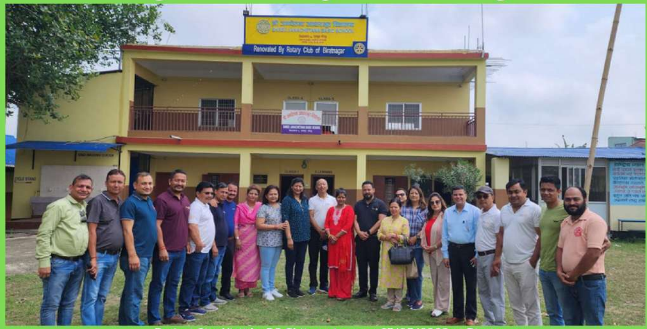
Project Site Visit by RC Chitwan team on 27/05/2023 at Biratnagar Happy School project under Global Grant No. 1984034 at Shree Janachetana Basic School, Biratnagar-6, Rampur

On 27/05/2023 Rotary Badminton Court at Biratnagar was jointly inaugurated by RC Biratnagar and RC Chitwan with focus on Health Fitness and Sports.