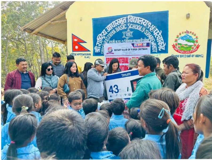
Construction of a toilet at Shree National Basic School in Parewakot, adopted by the Rotary Club of Purv Chitwan, is expected to cost Nrs. 260,000/- (Two lakh sixty thousand)