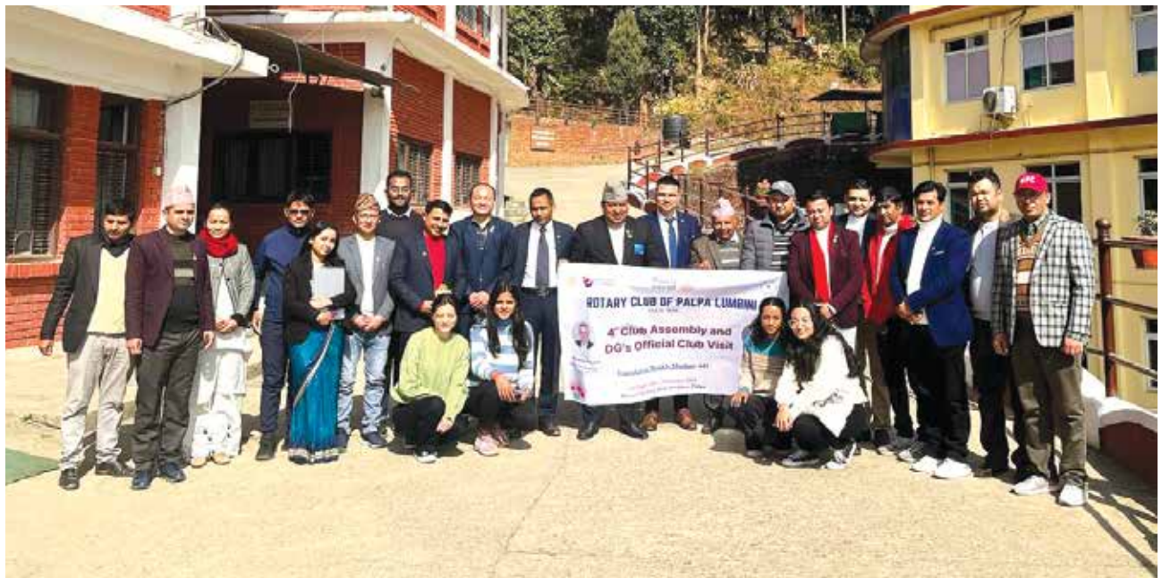
RC Palpa Lumbini DG Visit (3 February 2024)