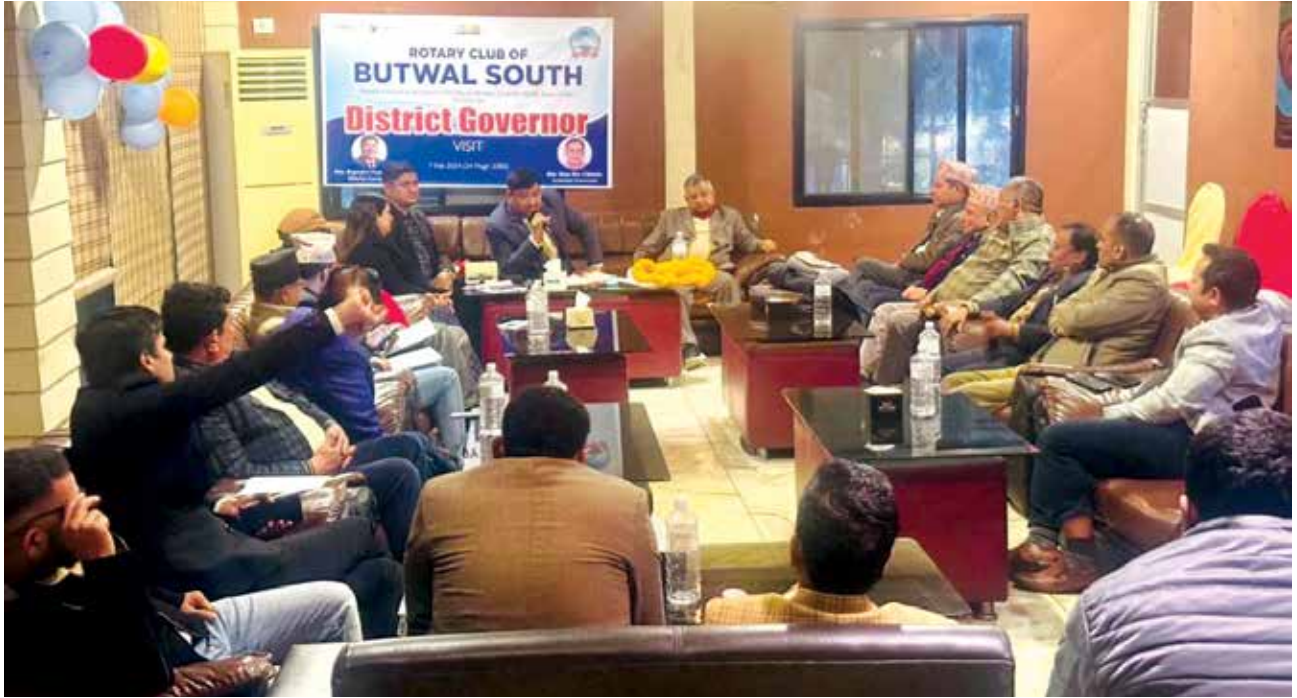
RC Butwal South DG Visit (7 February 2024)