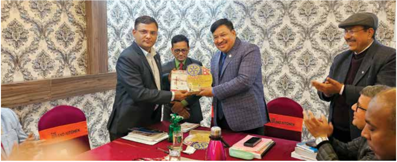
RC Bhairahawa DG Visit (8 February 2024)