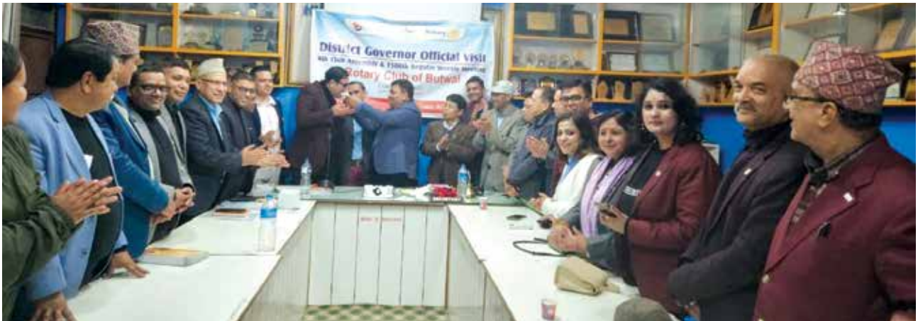
RC Butwal DG Visit (9 February 2024)