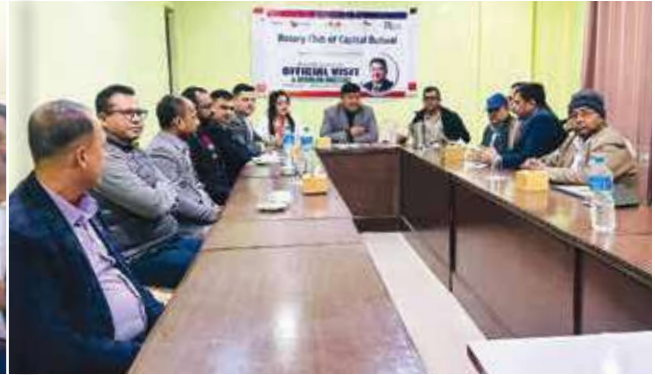
RC Capital Butwal DG Visit (4 February 2024)