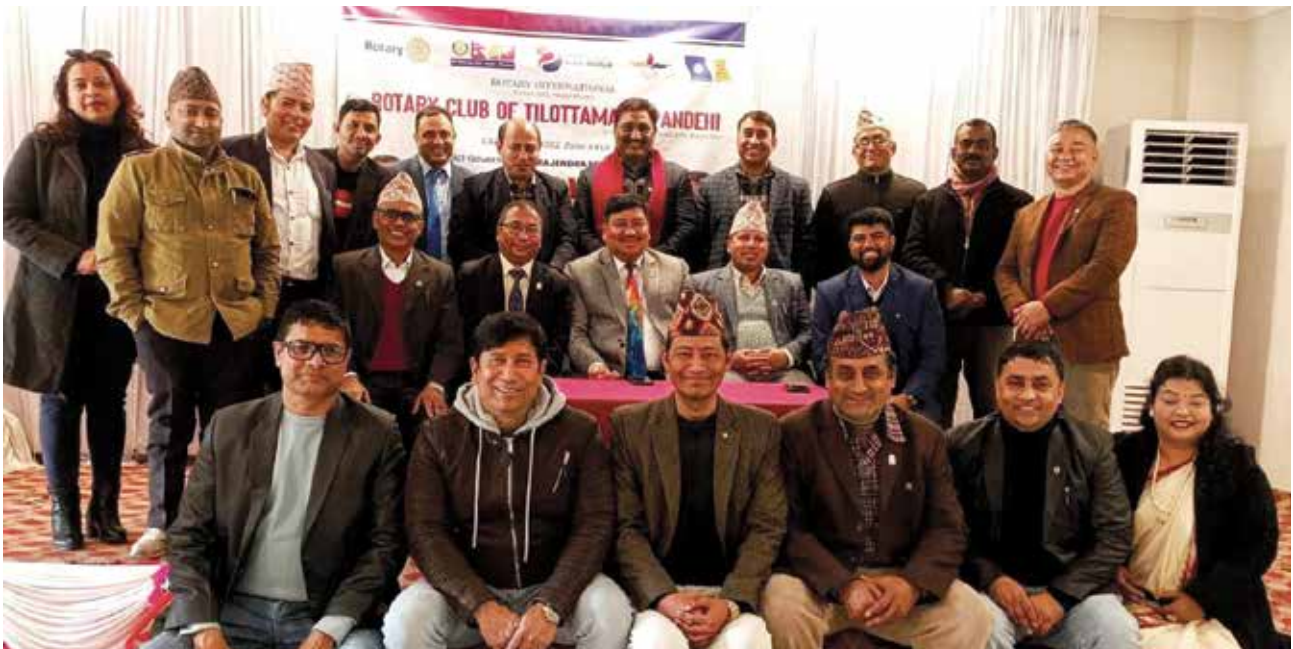
RC Tilotama Rupandehi DG Visit (5 February 2024)