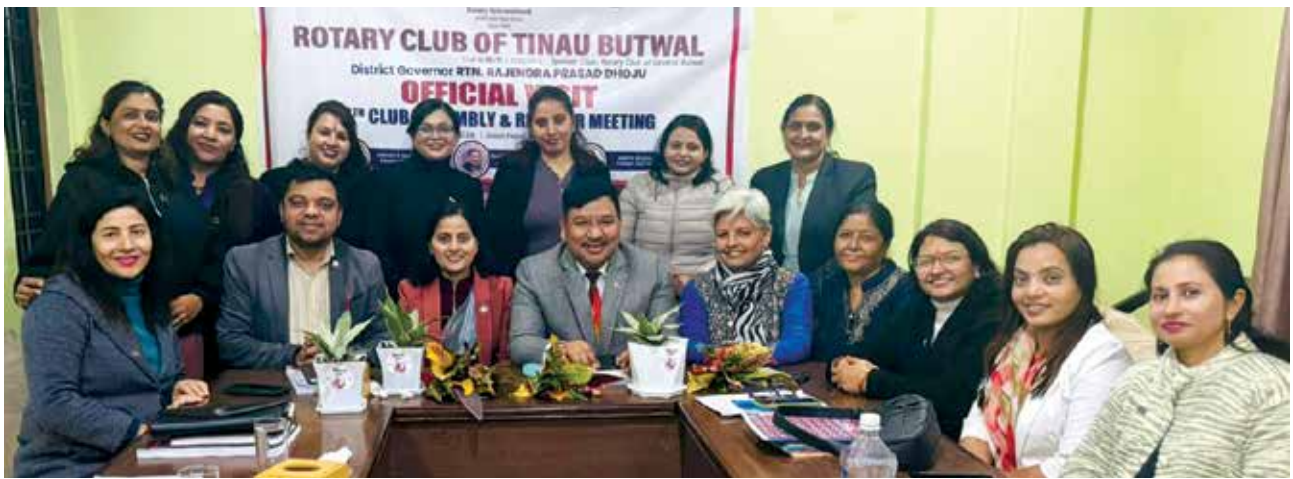
RC Tinau Butwal DG Visit (4 February 2024)