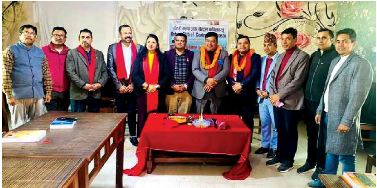
RC Central Kapilvastu DG Visit (2 February 2024)