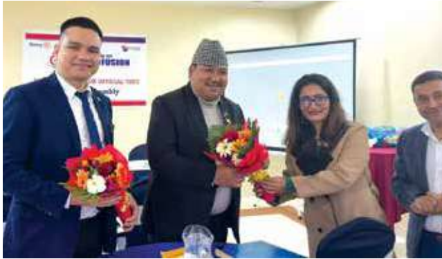
Rotay E-club of Medicofusion Hybrid Nepal DG Visit (3 February 2024)