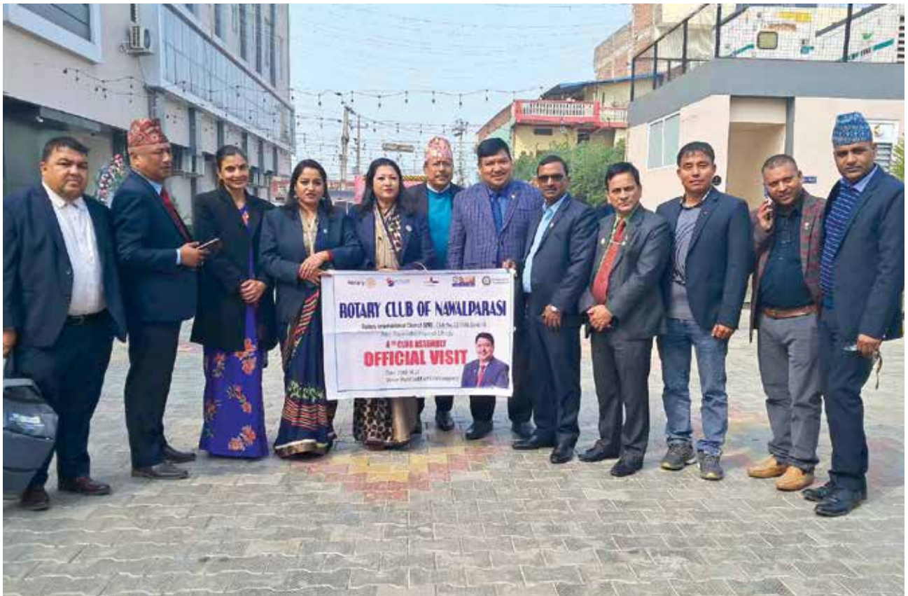
RC Nawalparasi DG Visit (8 February 2024)