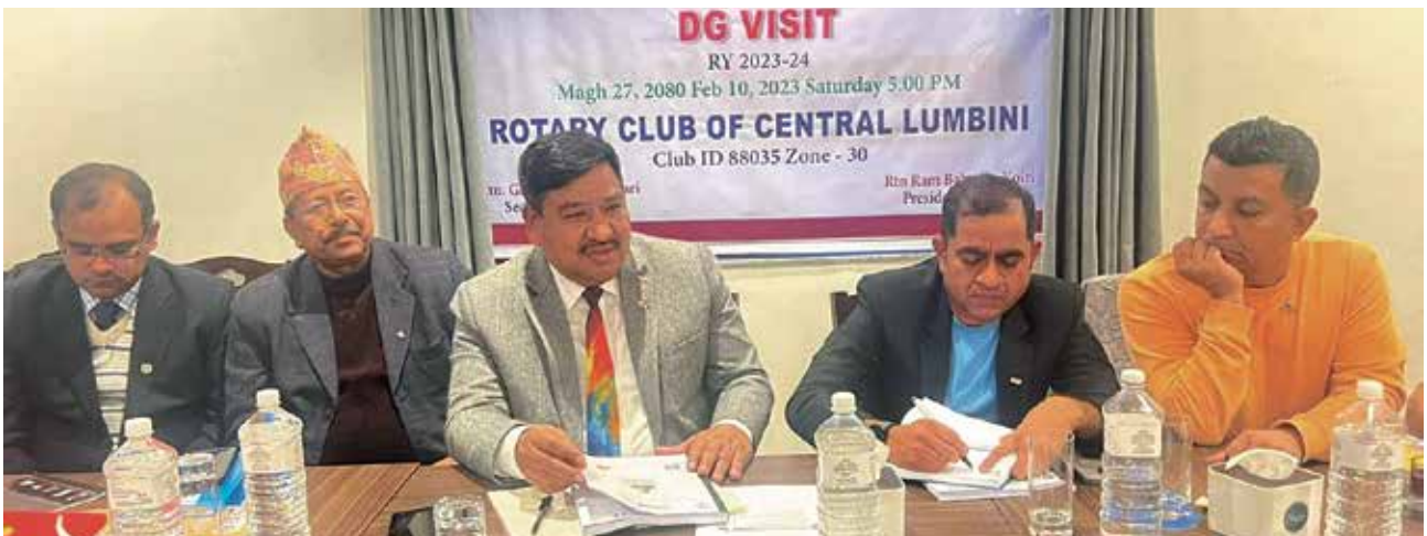
RC Central Lumbini DG Visit (10 February 2024)