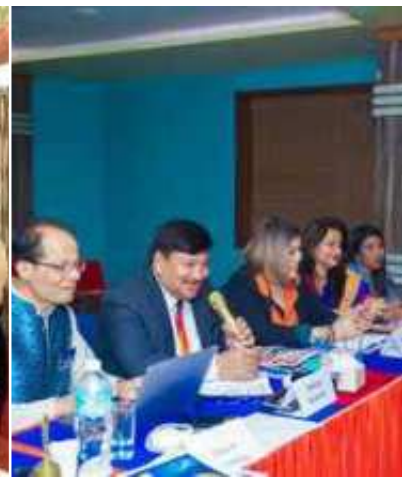
Birtamode Midtown (11 April 2024)