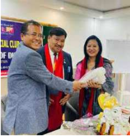
Dhading (5 April 2024)