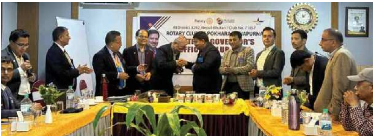
Pokhara Annapurna (2 April 2024)