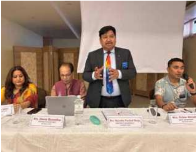
Itahari (10 April 2024)