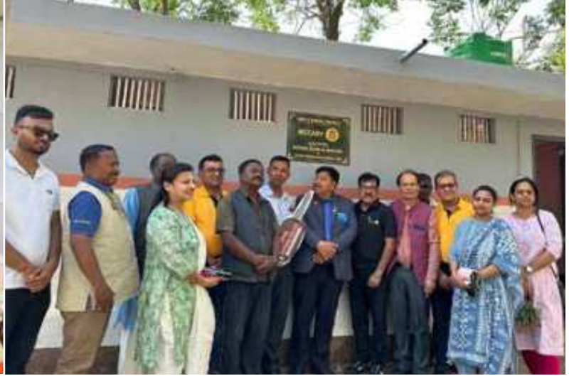
Birgunj (7 April 2024)