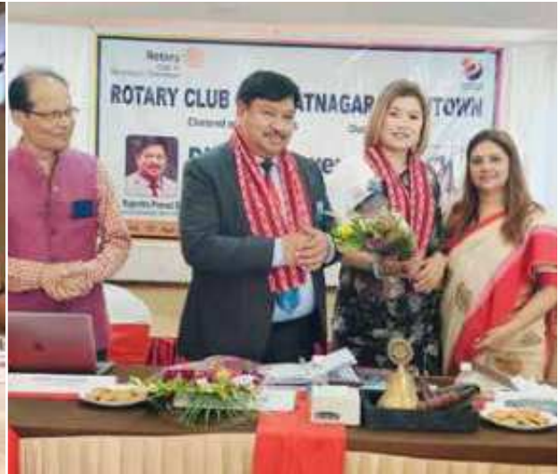
Biratnagar Downtown (10 April 2024)