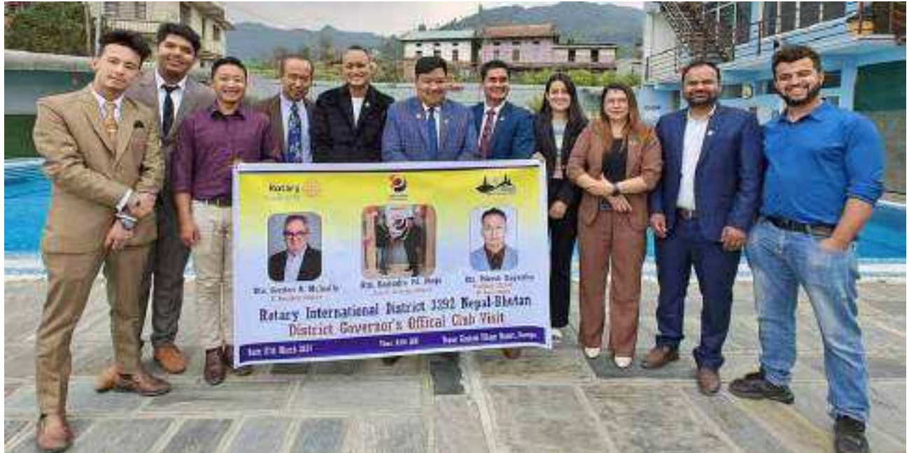
Kavre Valley (27 March 2024)