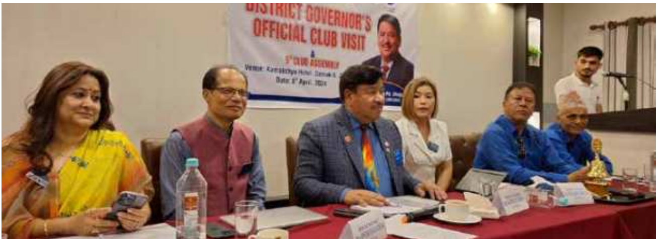
Damak (8 April 2024)