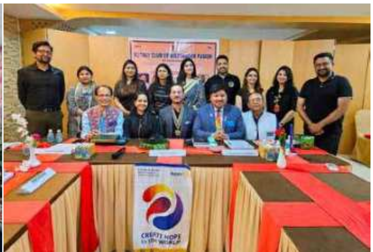
Biratnagar Fusion (9 April 2024)