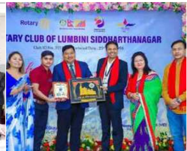
Lumbini Siddharthanagar (23 April 2024)