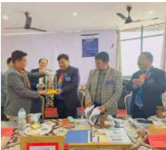
Baglung (3 April 2024)