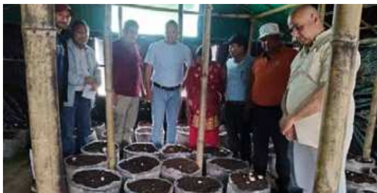
Monitoring Visit GG Button Mushroom at Kushadevi o2 Panauti Municipality 5th April 2024