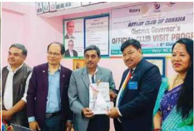
Gorkha (4 April 2024)