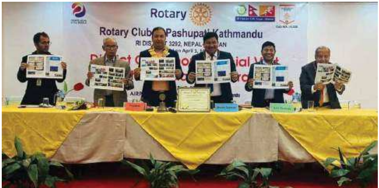
Pashupati Kathmandu (1 April 2024)