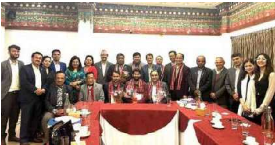
Kathmandu North East