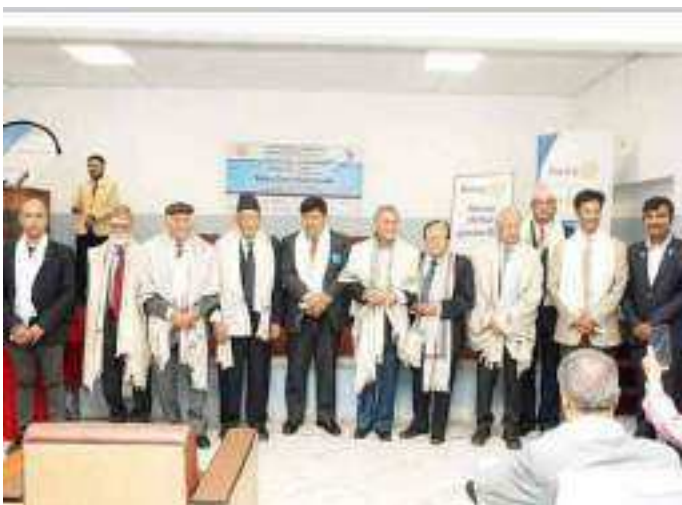
Kathmandu (12 April 2024)