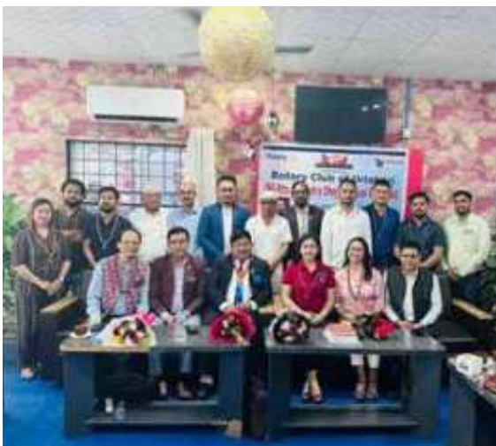
Urbari (9 April 2024)