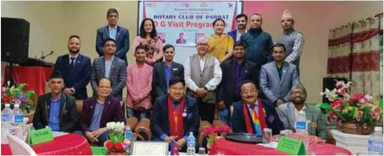
Parbat (2 April 2024)