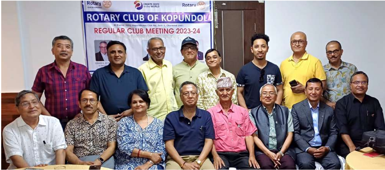
Joint Club Assembly of Rotary Club of Kopundol