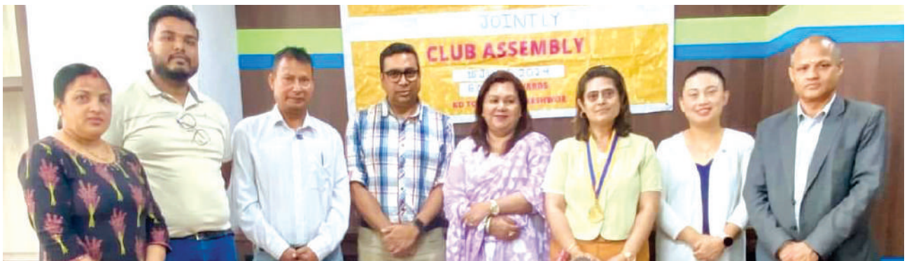
Joint Club Assembly of Rotary Club of Naxal Shakti