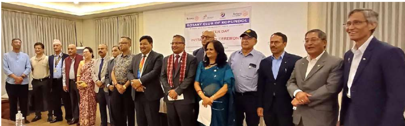
24th Charter Day and Installation Ceremony of RC Kopundol