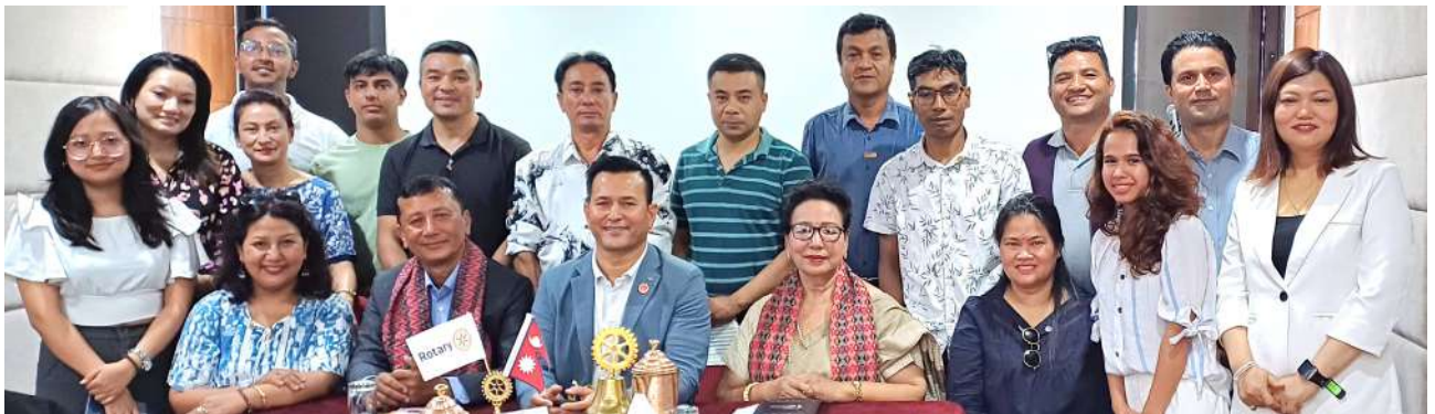
Joint Club Assembly of Rotary Club of Patan Heritage