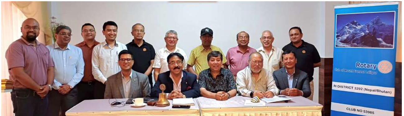
Joint Club Assembly of Rotary Club of Mount Everest