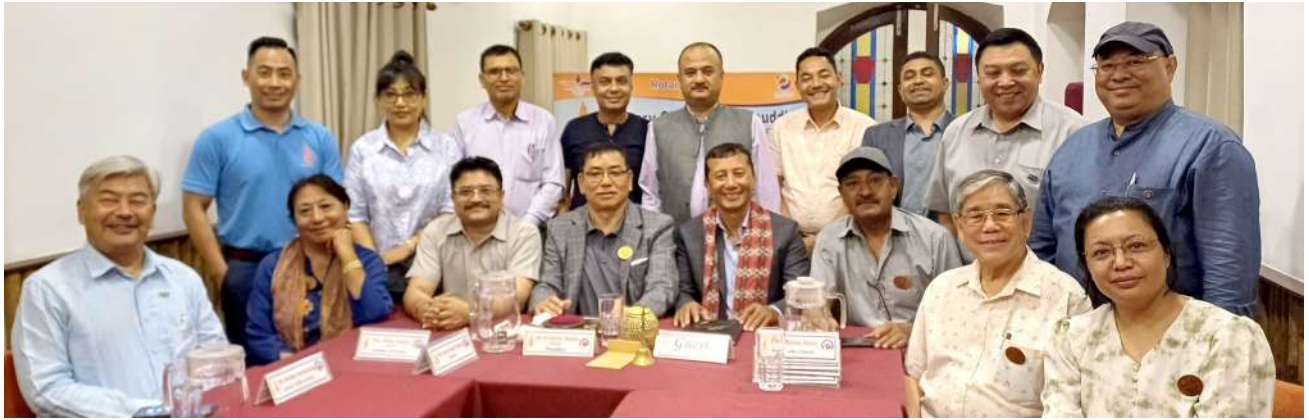
Joint Club Assembly of Rotary Club of Mahaboudha