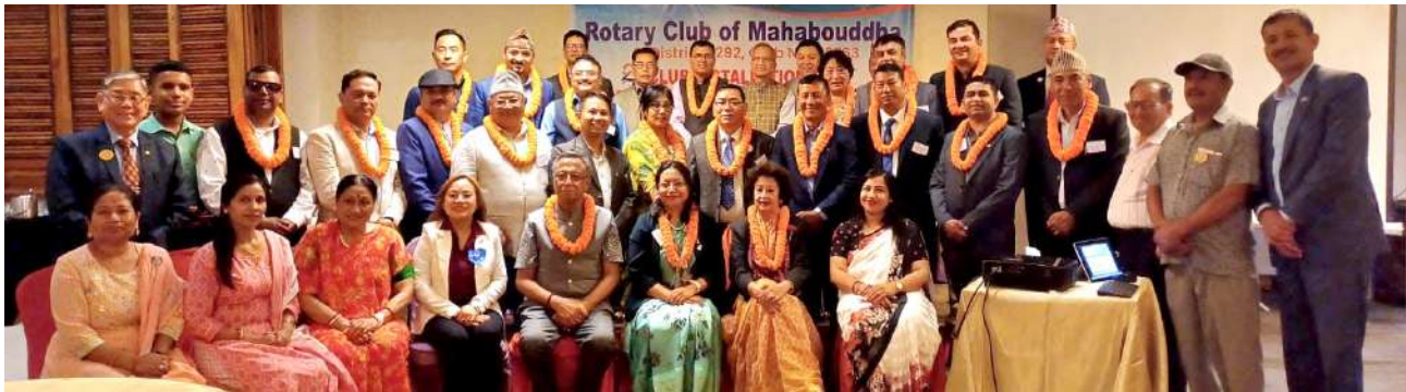
24th Charter Day and Installation Ceremony of RC Kopundol