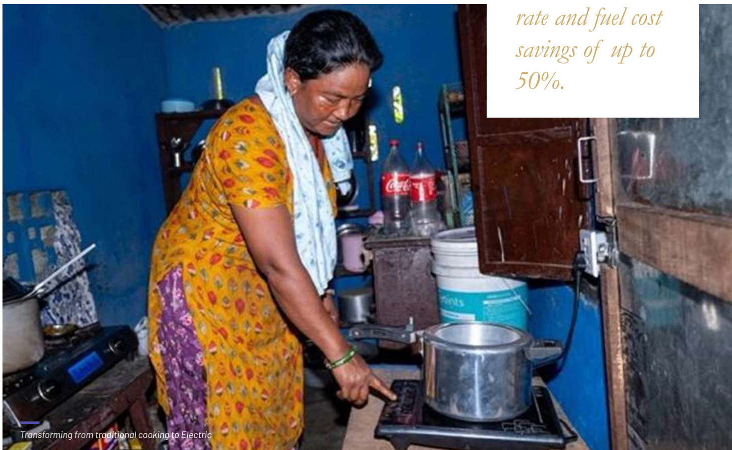
Transforming from traditional cooking to Electric

The pilot programme was a resounding success with up to 95% implementation rate and fuel cost savings of up to 50%.