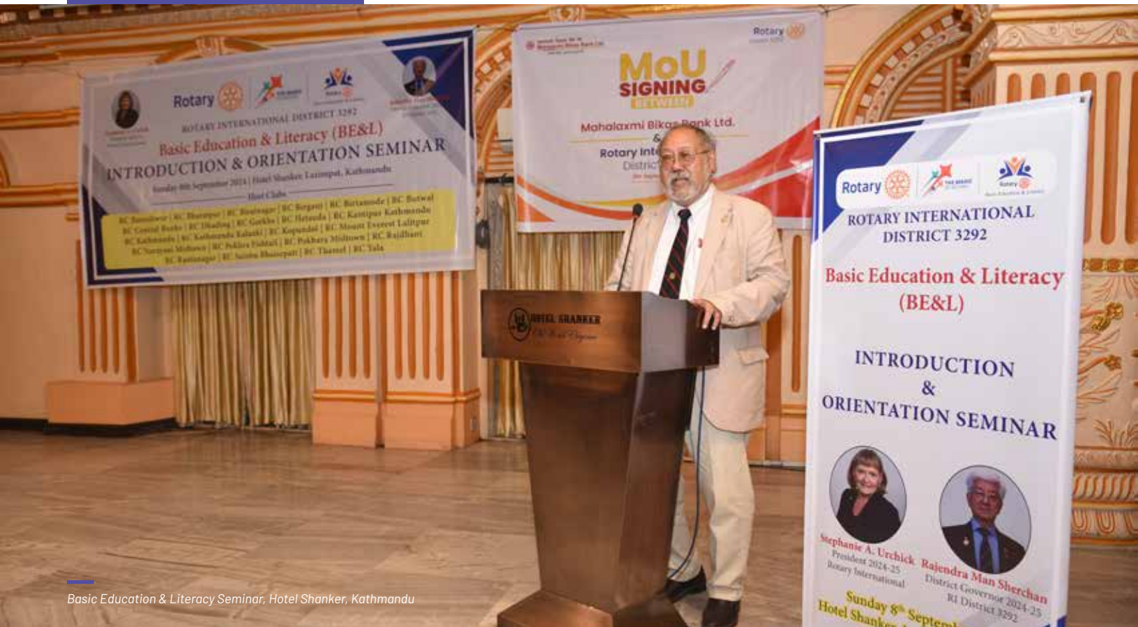
Basic Education & Literacy Seminar, Hotel Shanker, Kathmandu