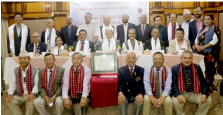
ROTARY CLUB OF THE HIMALAYAN GURKHAS