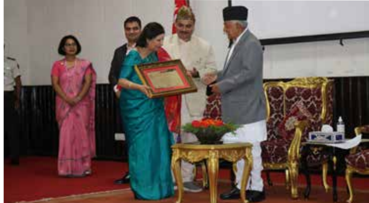
LIFETIME ACHIEVEMENT AWARD