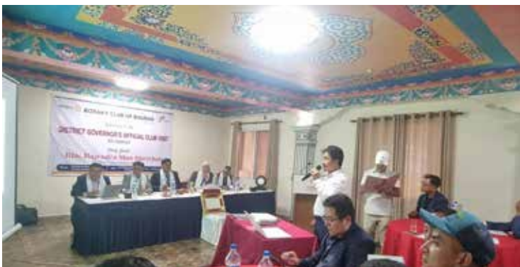
ROTARY CLUB OF BOUDHA