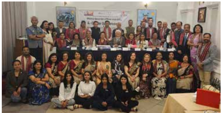
ROTARY CLUB OF GYANESHWOR